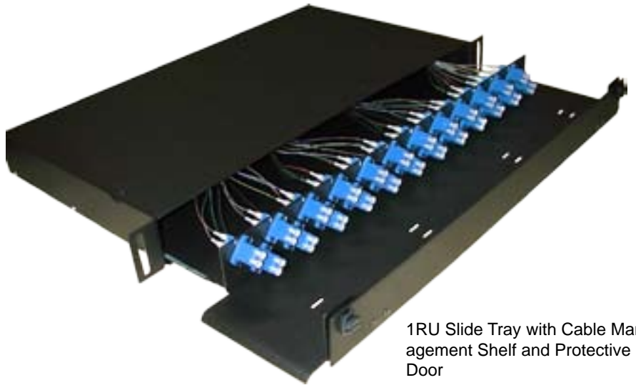
1RU Slide Tray with Cable Management Shelf and Protective Door