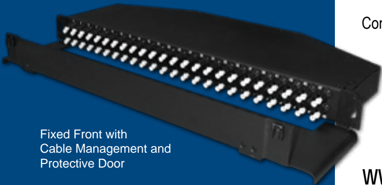
Fixed Front with Cable Management and Protective Door