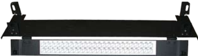
Cable Management Shelf & Protective Door