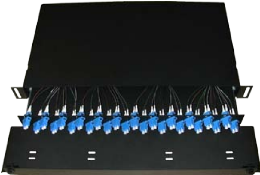
1RU with Slide Tray loaded with LC DPLX Adapters and array Cable Management and Protective Door